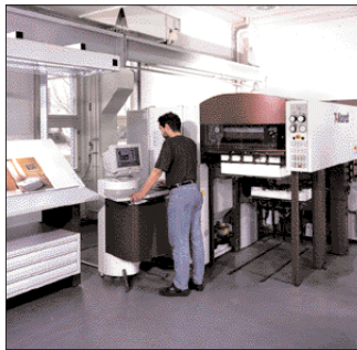
74 Karat not included in KBA results

Drupa and unlike Heidelberg managed to increase its interim profits in 2000. A backlog of newspaper presses on order lasts well